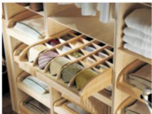
Specialty Features for Your Closet 7 Photos