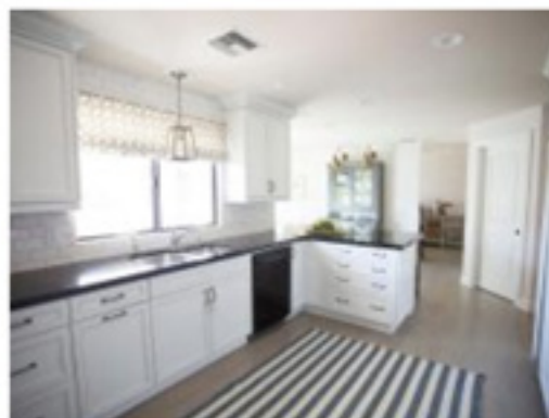
30 Budget Kitchen Updates That Make a Big Impact 30 Photos