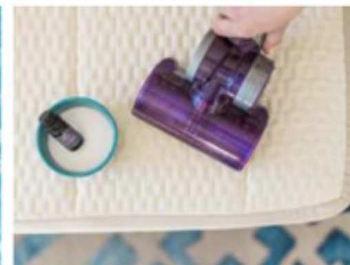
Home Survival Skills: Cleaning Essentials That Make Life Easier 12 Photos