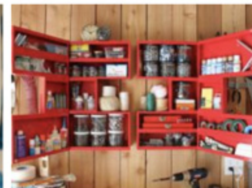
12 Genius Garage Organizing and Storage Hacks 12 Photos