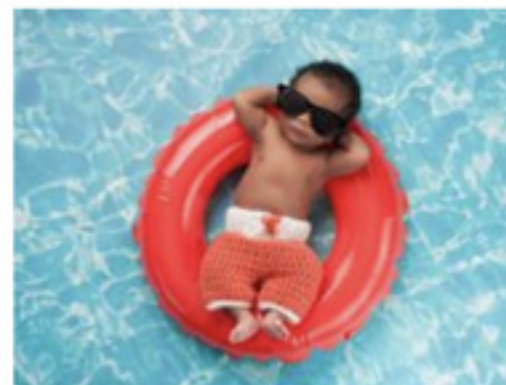
15 Adorably-Unique Ways to Capture Baby's First Year 15 Photos