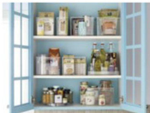
20 Organizers for a Picture-Perfect Pantry 20 Photos